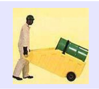
Large 10" wheels and ergonomic design make transport trouble free.