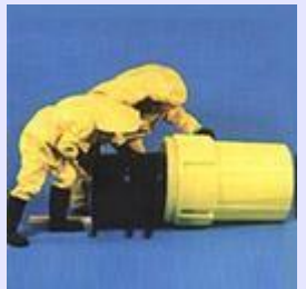
Nestable design for efficient storage.