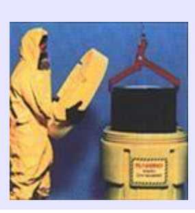
Drum truck portable.